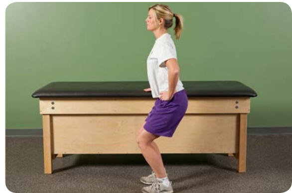
1/4 Mini squats