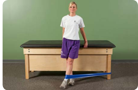
Standing theraband/pulley weight – Adduction