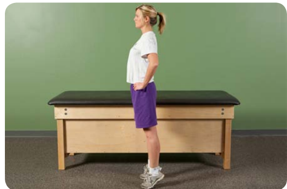
Standing heel lifts