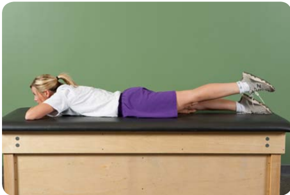
Leg raise – Extension