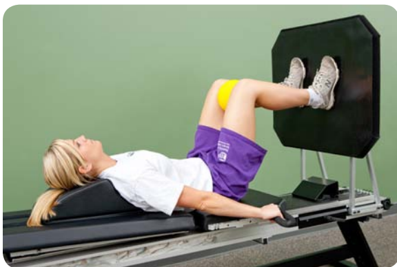
Shuttle leg press 90 degree hip flexion with co-contraction of adductors