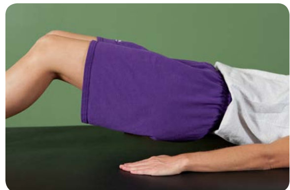
Double leg bridges