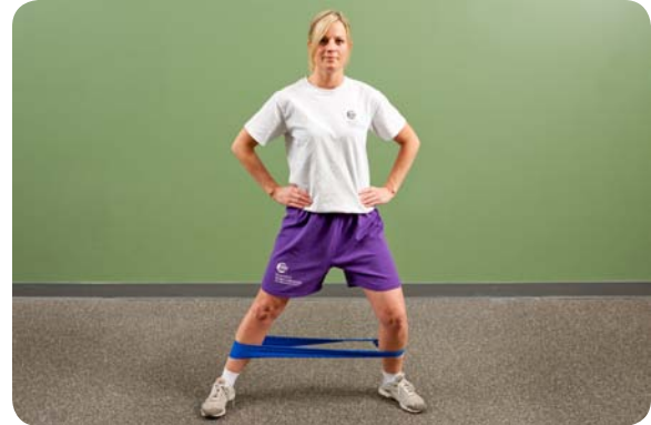
Sidestepping with resistance (pause on affected limb), sports cord walking forward and backward (pause on affected limb)