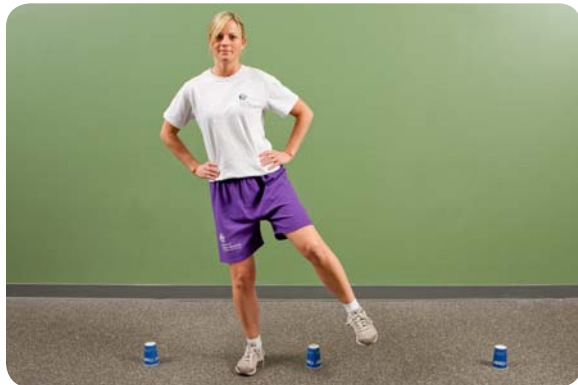
Lateral walking over cups and hurdles (pause on affected limb), add ball toss while walking