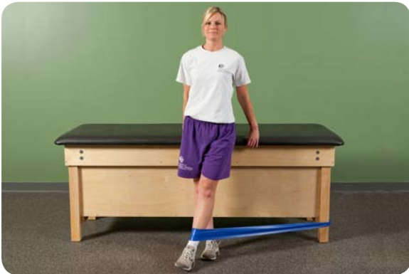
Theraband resistance on affected side – Adduction (start very low resistance)