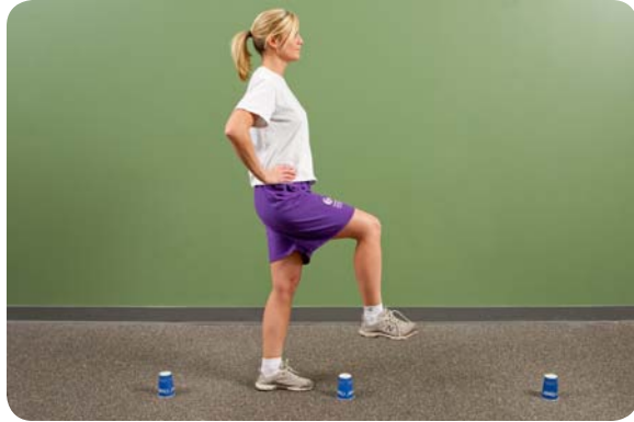
Forward walking over cups and hurdles (pause on affected limb), add ball toss while walking