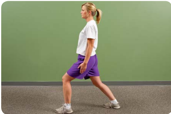
Lunges progress from single plane to tri-planar, add medicine balls for resistance and rotation