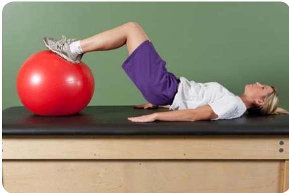
Physioball hamstring exercises – hip lift, bent knee hip lift, curls, balance