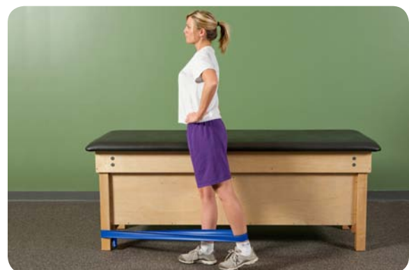
Standing theraband/pulley weight – Extension