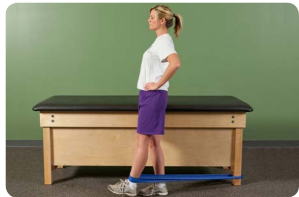
Standing theraband/pulley weight – Flexion