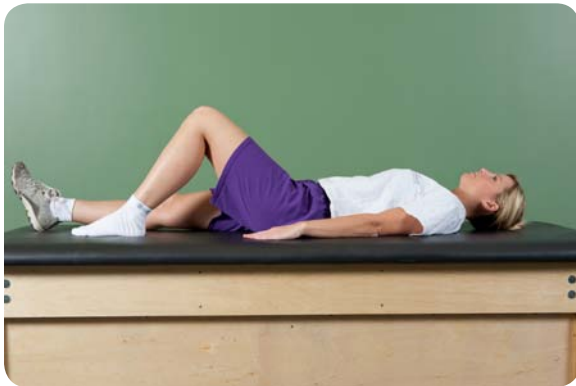
Heel slides, active-assisted range of motion