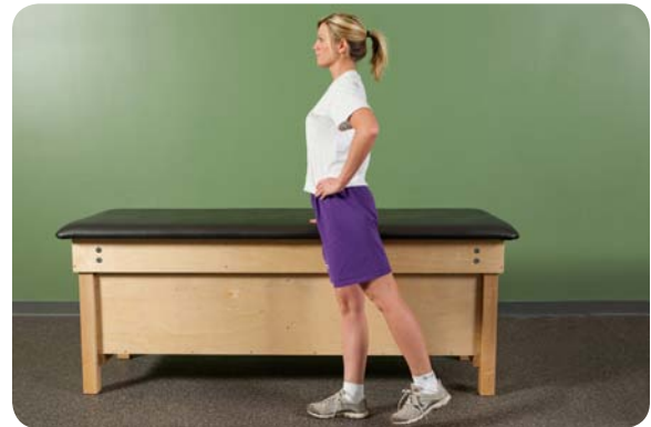
Standing extension without resistance