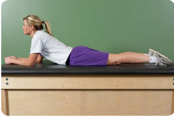
Prone on elbows