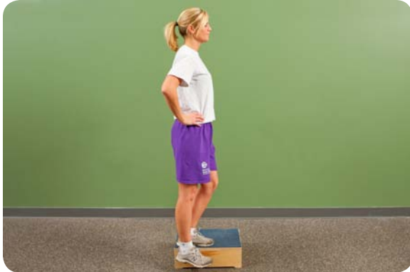
Step-ups with eccentric lowering