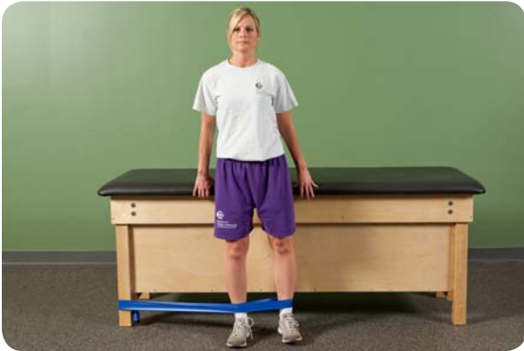
Theraband resistance on affected side – Abduction (start very low resistance)