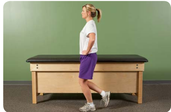
Single leg body weight squats, increase external resistance, stand on soft surface