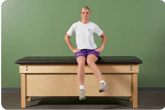
Seated weight shifts, lateral