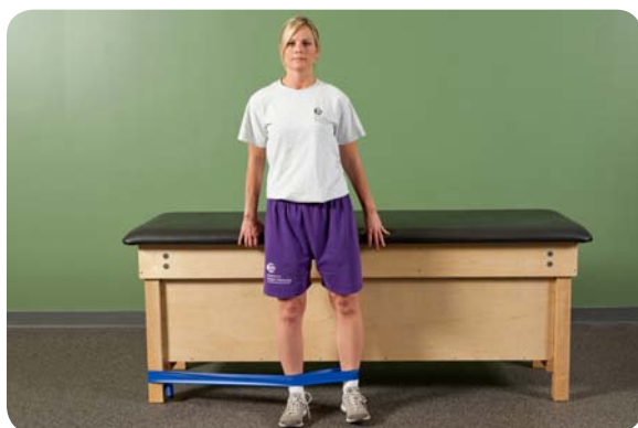
Standing theraband/pulley weight – Abduction