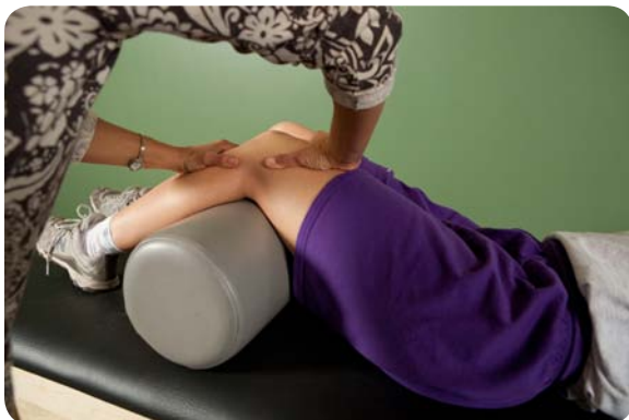
Stiffness dominant hip mobilization – grades III, IV