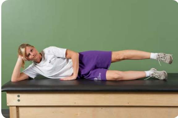
Leg raise – Abduction