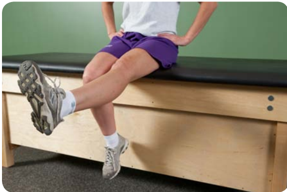
Seated knee extensions