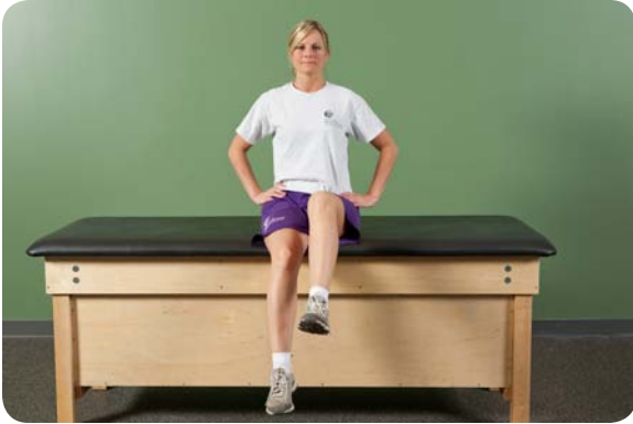
Hip flexion, IR/ER in pain-free range