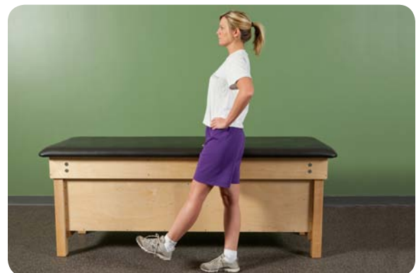
Standing flexion without resistance