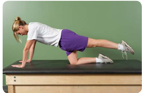
Quadruped 4 point support, progress 3 point support, progress 2 point