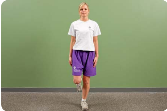
Single leg balance – firm to soft surface