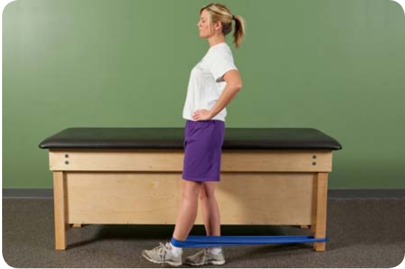
Theraband resistance on affected side – Flexion (start very low resistance)