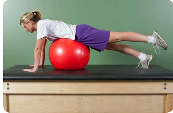
Superman on physioball – 2 point on physioball