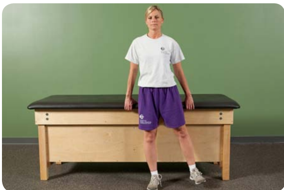
Standing abduction without resistance