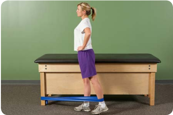
Theraband resistance on affected side – Extension (start very low resistance)