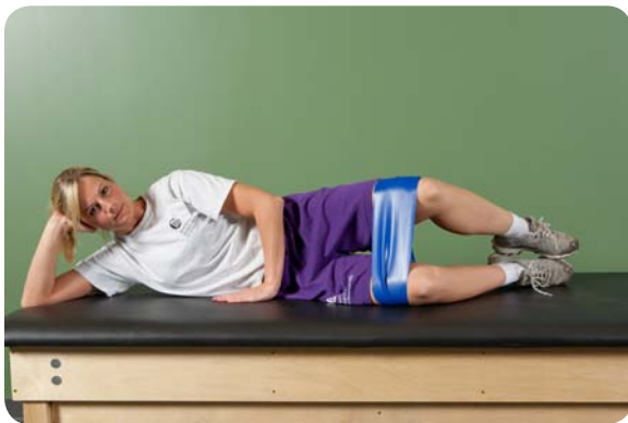
Clamshells with theraband