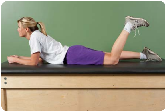
Prone knee flexion