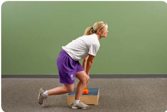
Single leg pick-ups, add soft surface