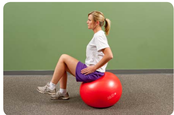
Seated physioball progression – hip flexion