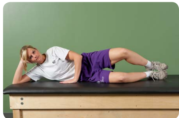
Clamshells (pain-free range)