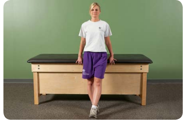
Standing adduction without resistance