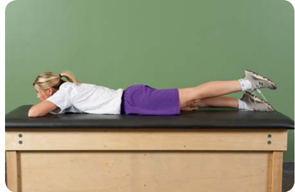
Leg raise – Extension