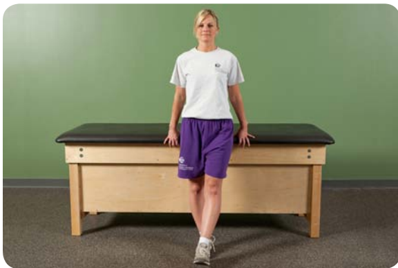
Standing adduction without resistance