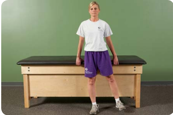
Standing abduction without resistance