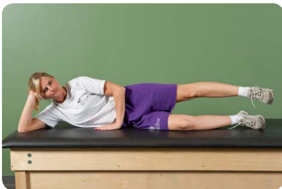
Leg raise – Abduction