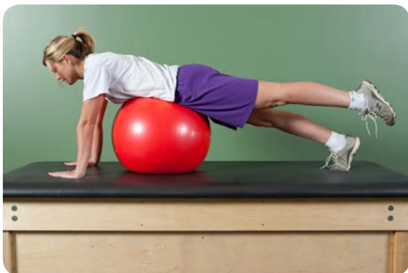
Superman on physioball – 2 point on physioball