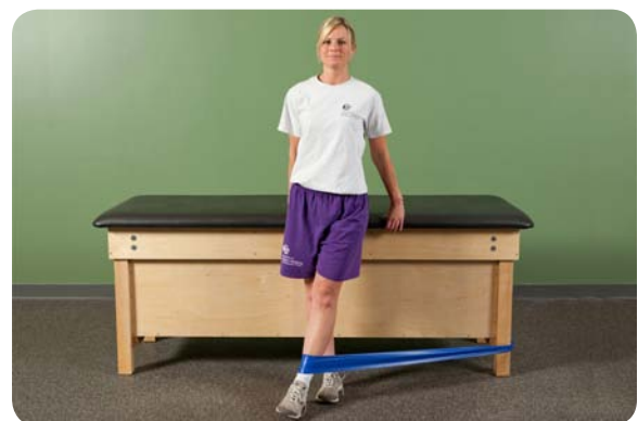
Theraband resistance on affected side – Adduction (start very low resistance)