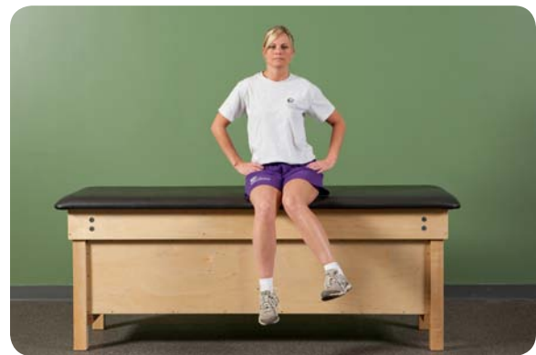
Seated weight shifts