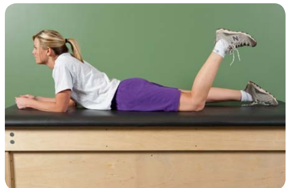
Prone knee flexion