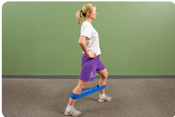
Theraband walking patterns – forward, sidestepping, carioca, monster steps, backward, ½ circles forward/backward – 25 yds. Start band at knee height and progress to ankle height