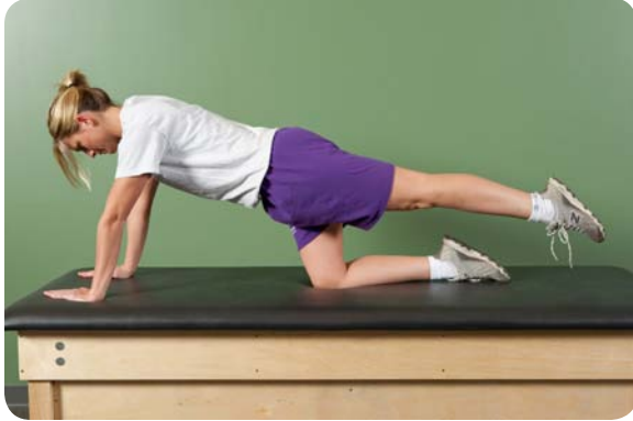
Quadruped 4 point support, progress 3 point support, progress 2 point