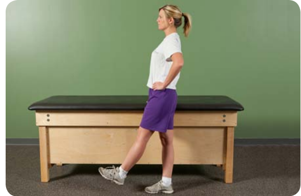
Standing flexion without resistance