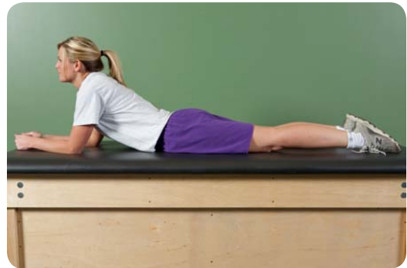
Prone on elbows