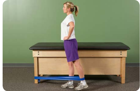
Theraband resistance on affected side – Extension (start very low resistance)