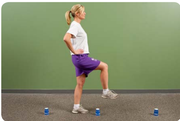
Forward walking over cups and hurdles (pause on affected limb), add ball toss while walking