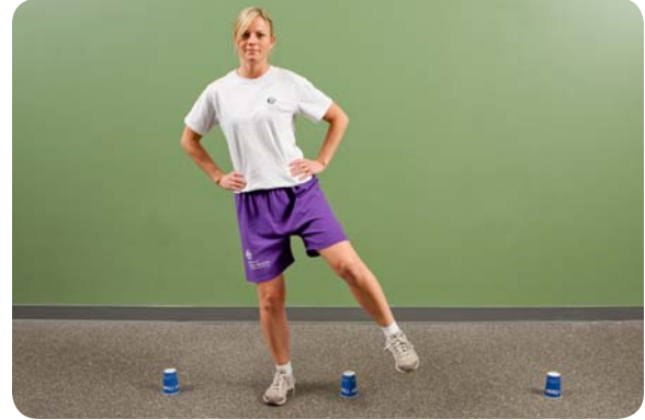
Lateral walking over cups and hurdles (pause on affected limb), add ball toss while walking