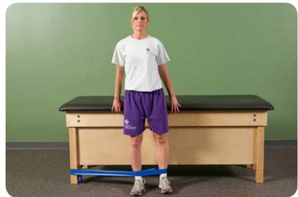
Theraband resistance on affected side – Abduction (start very low resistance)