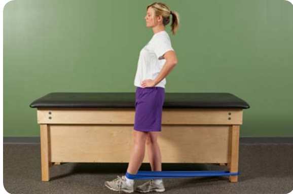
Theraband resistance on affected side – Flexion (start very low resistance) ONLY IF TOLERATED