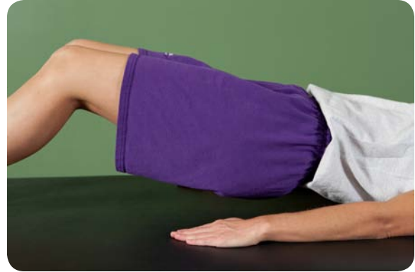
Double leg bridges