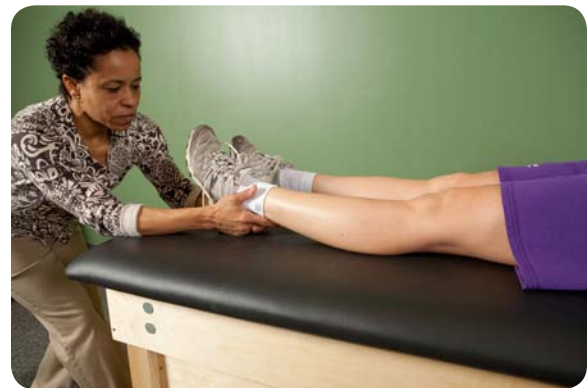
Pain dominant hip mobilization – grades I, II